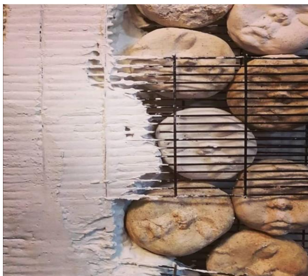
Figure 4. Instability in life - this condition is not suitable for children (2020), Faten Nabil, Lebanon