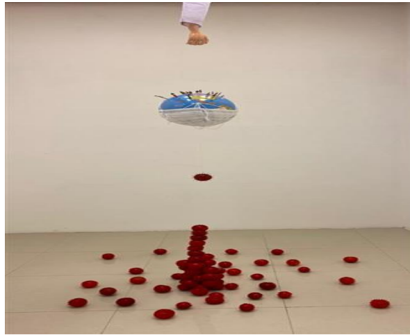
Figure 3. Protection 1(2021), Naela Al Maamari, Sultanate of Oman