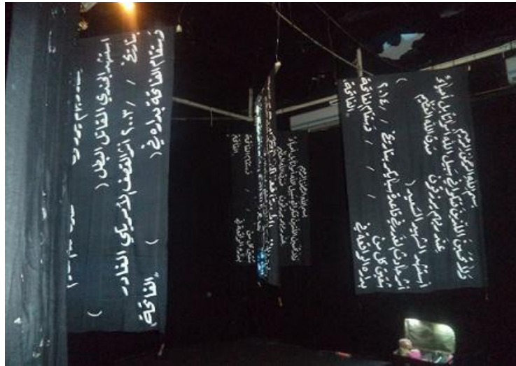
Figure 6. Chamber of Terror (2016), Zaina Salem, Iraq